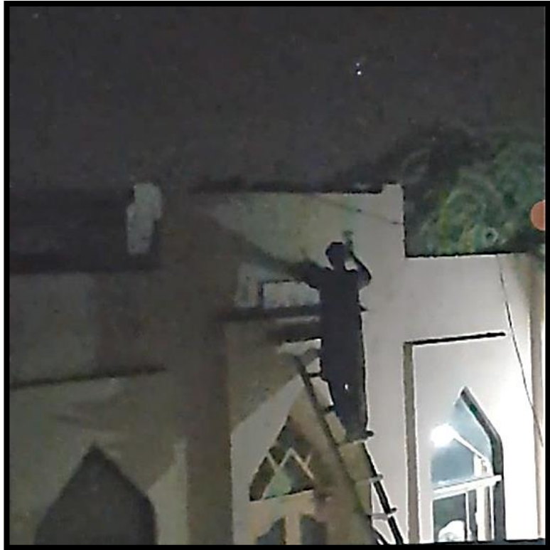
(POLICE IN CIVILIAN DRESS ERASING THE KALIMA WITH HAMMER)