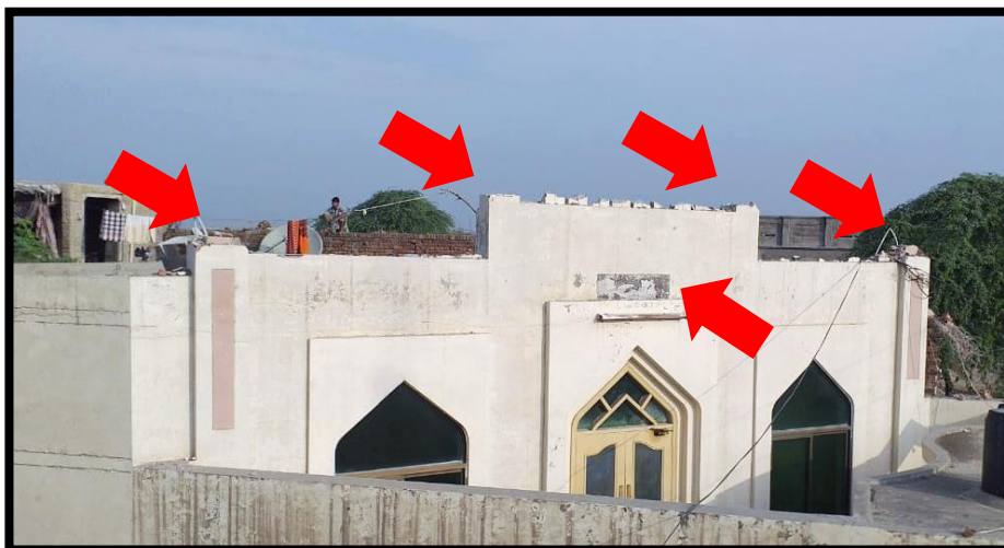
(AFTER THE ERASING OF KALIMA AND DEMOLITION OF MINARETS)