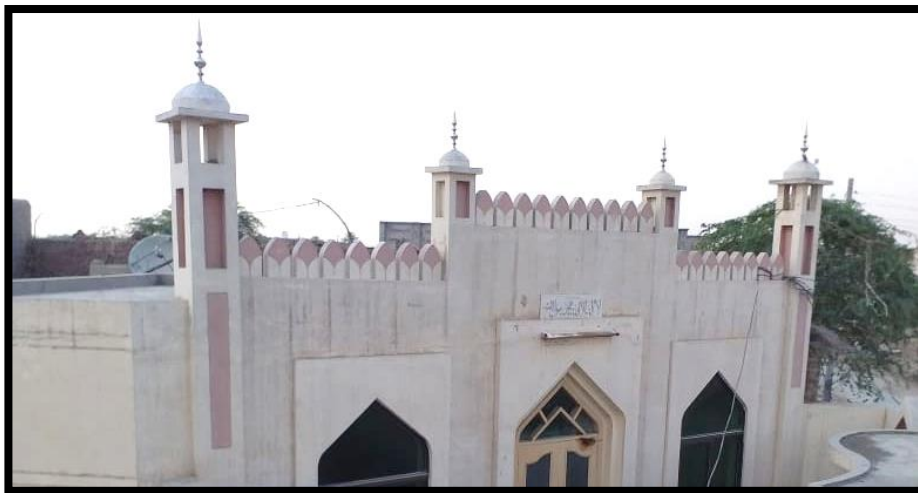
(BEFORE THE ERASING OF KALIMA AND DEMOLITION OF MINARETS)